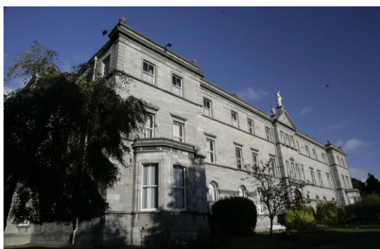
St Mary's building

The earliest building on the campus, St Mary's, dates to 1900, and was originally home to the General Council of the Christian Brothers and a teacher training college for the Congregation. Lay students began to attend the college in 1972. Since 1999, MIE has undertaken an expansive development programme, so that its historic buildings are maintained to the highest order, and are complemented by the modern Nagle-Rice Hall, the newest addition to the MIE campus, which consists of four seminar rooms, a lecture theatre with tiered seating, an outstanding sports hall, a fitness room and a spacious dining area.