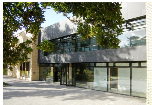
Nagle Rice Hall