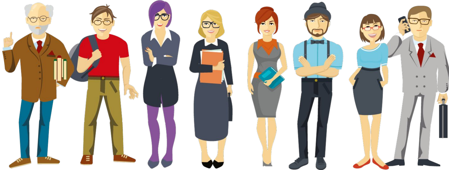
Chief Mentor DAY 0-7

Experienced mentors and entrepreneurs with outstanding skills in marketing, design, and IT work closely together with the students to nurture the spirit of innovation.